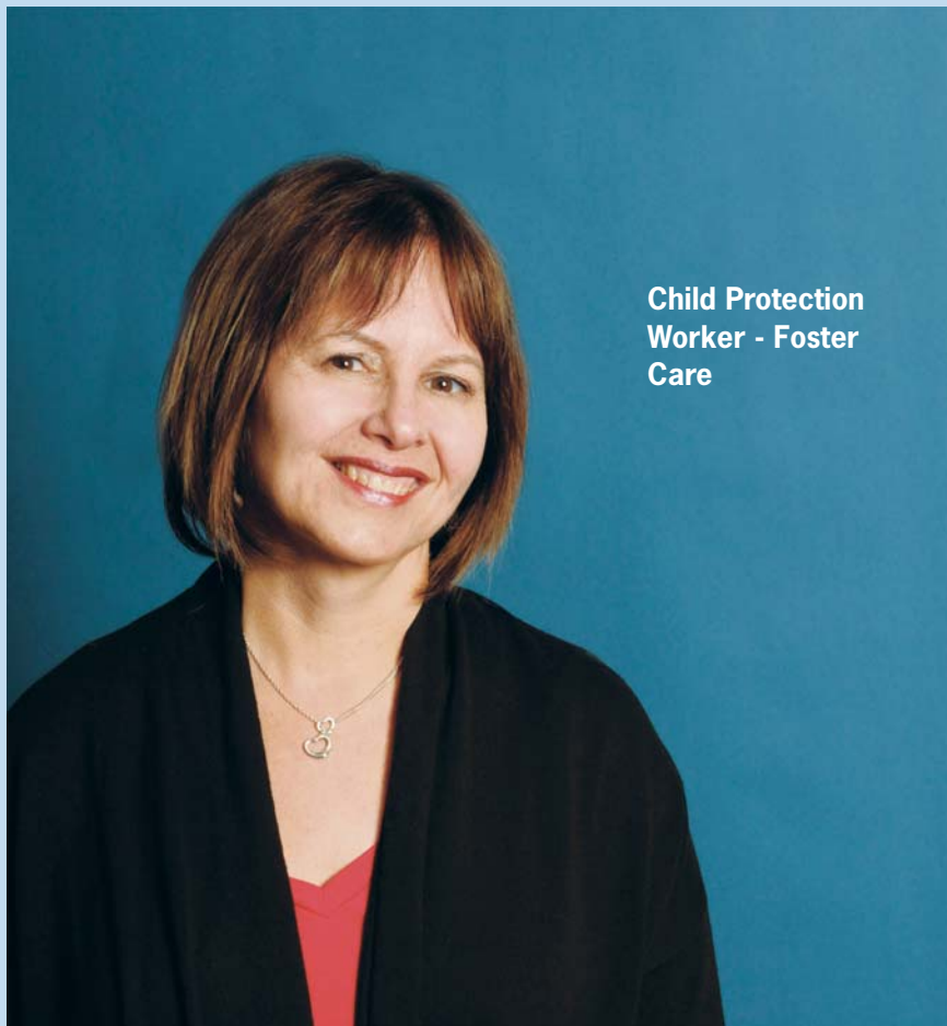
Child Protection Worker - Foster Care

This kind of work really gets into your blood – people here really, really care about kids and we make sure that foster families are equipped with the skills, knowledge, resources and support to meet each child’s needs. Sometimes really magical things happen. I remember one foster mom had a child from birth to age two, while the mom had visitation. When the child was returned to the birth family, the mother wrapped up a framed photo of the child as a thank-you for all the work that the foster mother had done. It was a wonderful thing.